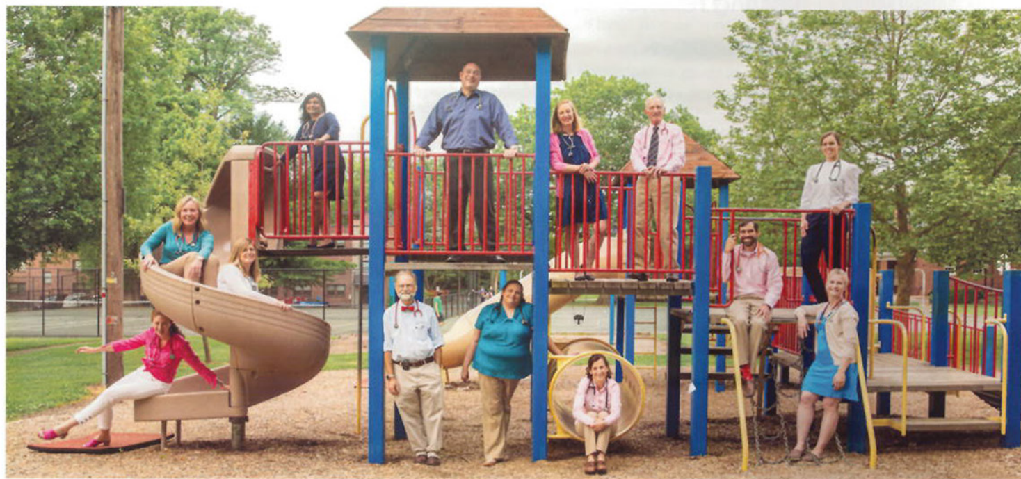
The Doctors of Lancaster Pediatrics